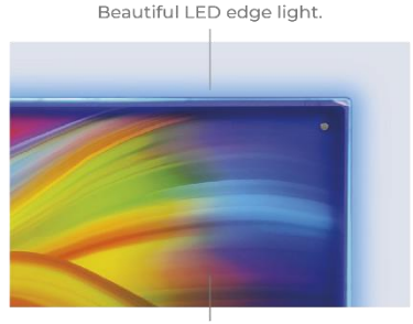
Vibrant HD digital printed faceplate that's interchangable.

Marketing Messages change and so can the faceplates. They're completely interchangeable and switching out is a breeze with no special tools required.